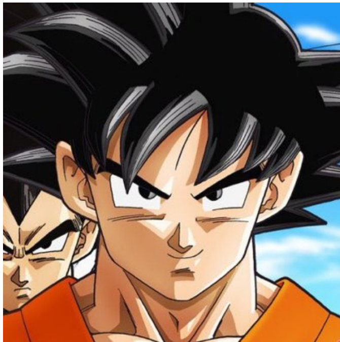
Figure 1.1: A test figure. This caption is huge, but in the list of figures only the smaller version in the square brackets will appear.

language. There is no need for special content, but the length of words should match the language.